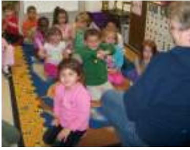
The Preschool sings songs at Circle